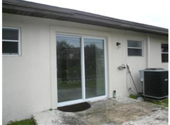
Not shuttered or impact rated