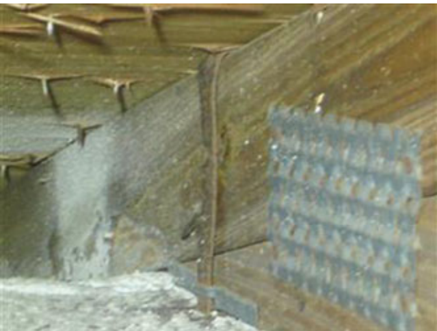
Strap with 1 nail